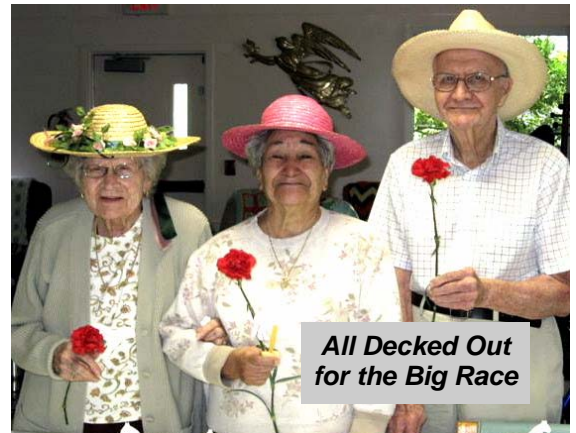
All Decked Out for the Big Race

Activities play a major role in making the Adult Center an inviting place to spend the day. Each month clients enjoy a full program ranging from ceramics and crafts, musical programs, guest speakers, daily news discussions, and of course, the perennial favorite, BINGO! To the right are three of our clients wearing their finest hats for the big race on our themed Kentucky Derby Day .